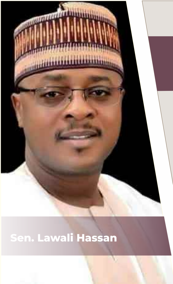
Sen. Lawali Hassan