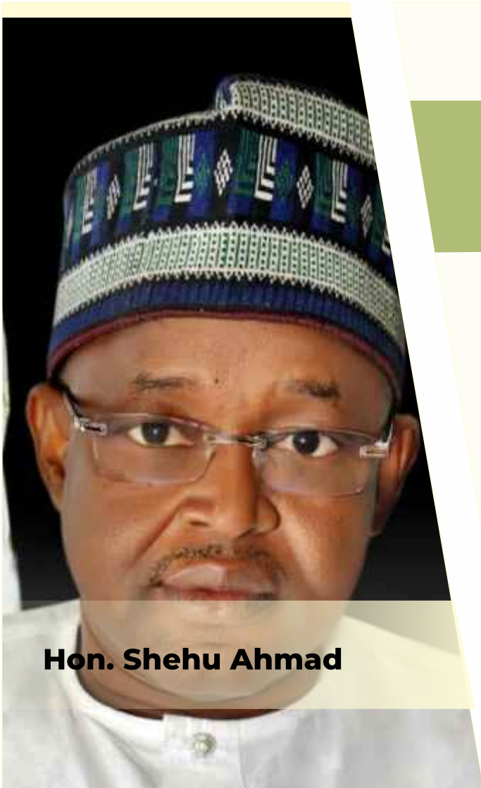
Hon. Shehu Ahmad