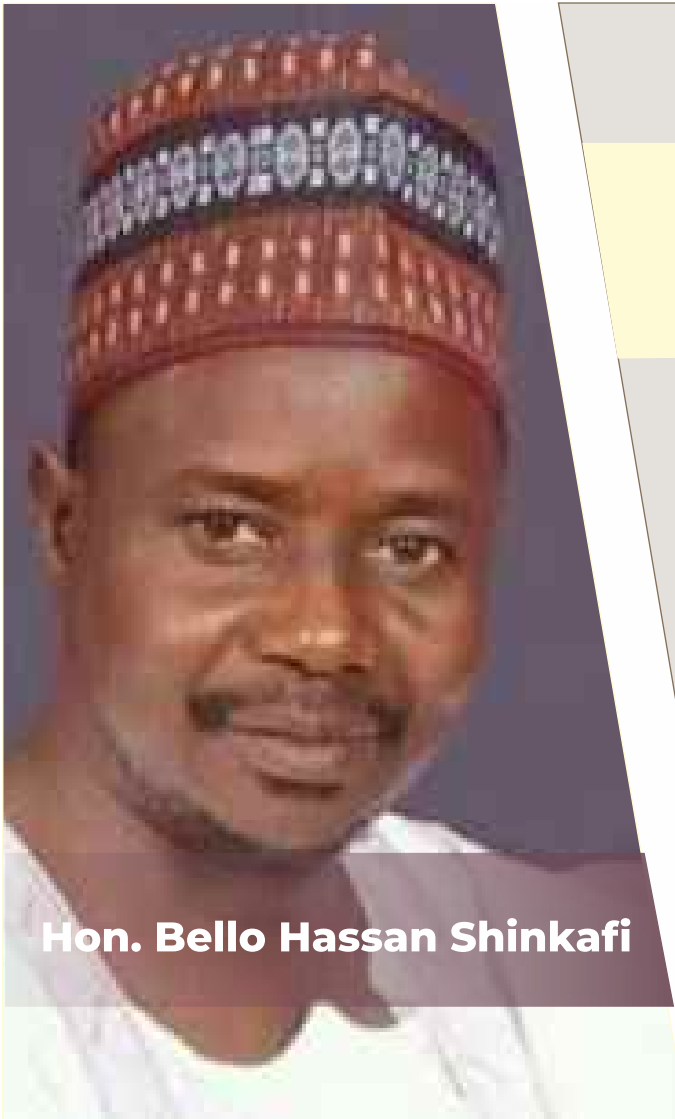
Hon. Bello Hassan Shinkafi