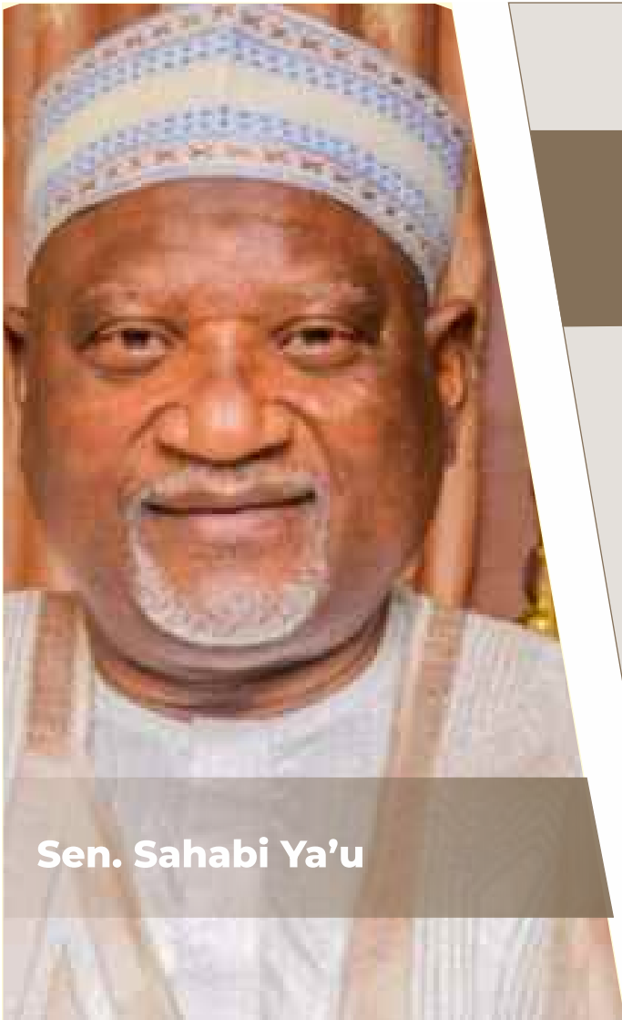
Sen. Sahabi Ya'u