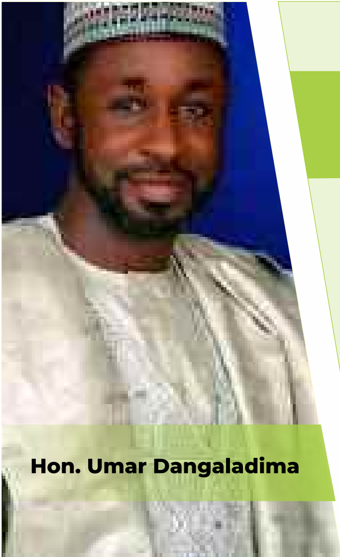
Hon. Umar Dangaladima