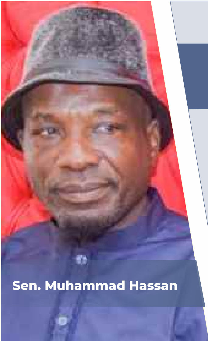
Sen. Muhammad Hassan