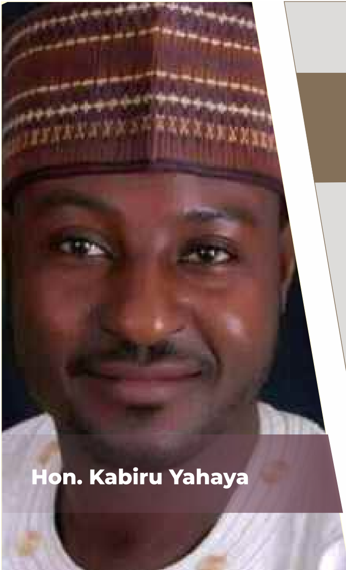
Hon. Kabiru Yahaya